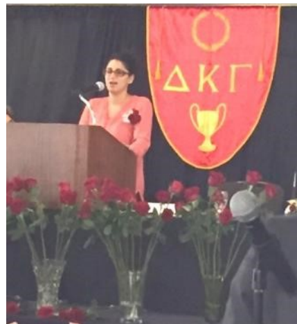
Dr. Mona Hanna- Attisha received the Friend of Education Award for her efforts in the Flint water crisis.