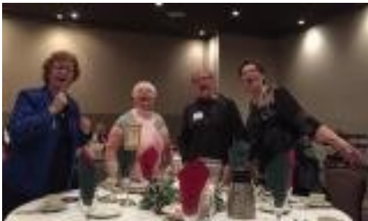
"...and a partridge in a pear tree!"