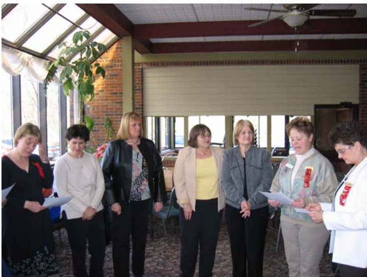
Initiation Ceremony of New Members at Subu's Leather Bottle, April 22, 2009.