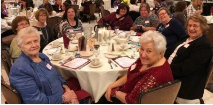
The Zeta chapter is always well represented at our auction, and we appreciate their support!